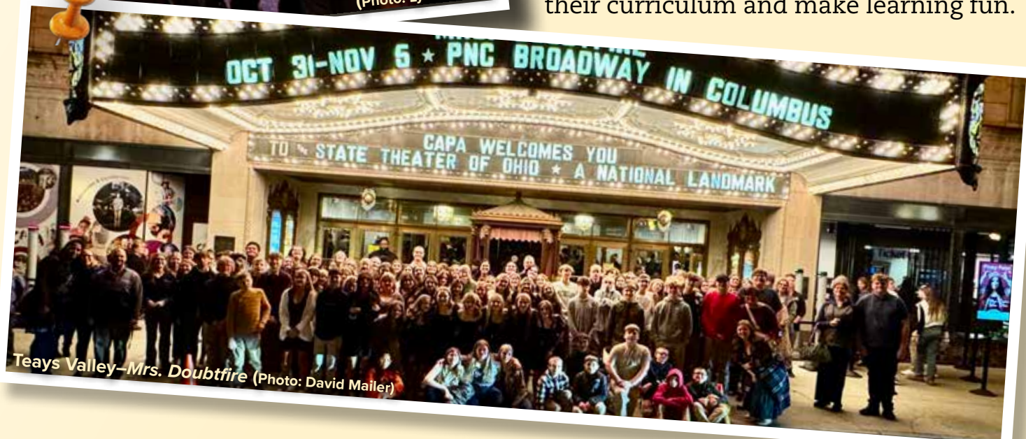
Teays Valley - Mrs. Doubtfire