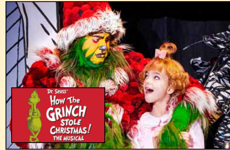
Dr. Seuss' How The GRINCH STOLE CHRISTMAS! THE MUSICAL