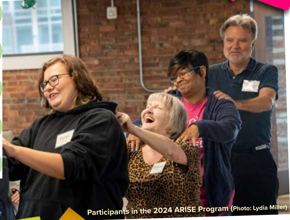
Participants in the 2024 ARISE Program