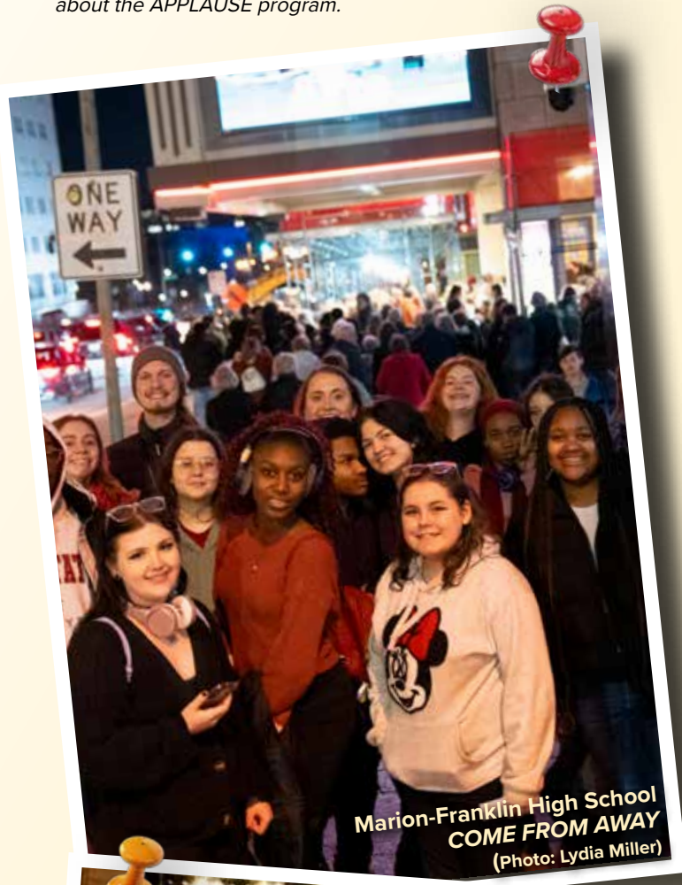
Marion-Franklin High School COME FROM AWAY

Open to all public, private, and charter schools, this program provides subsidized tickets to help educators use the power of Broadway to serve as a tool to enhance their curriculum and make learning fun.