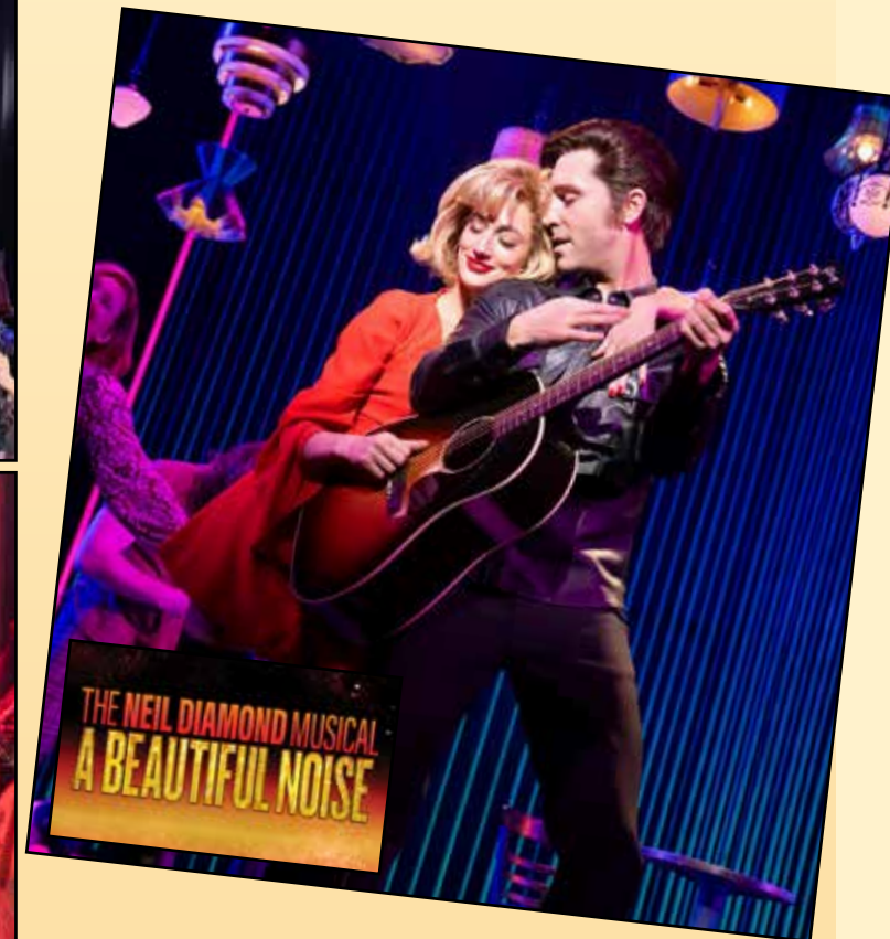
THE NEIL DIAMOND MUSICAL A BEAUTIFUL NOISE

Applications opened in September and will remain open until all tickets are awarded. Educators who apply are asked to supply information about their school, their classroom, and how they will connect the Broadway show to their classroom curriculum. A lesson plan demonstrating those curricular connections is also required.