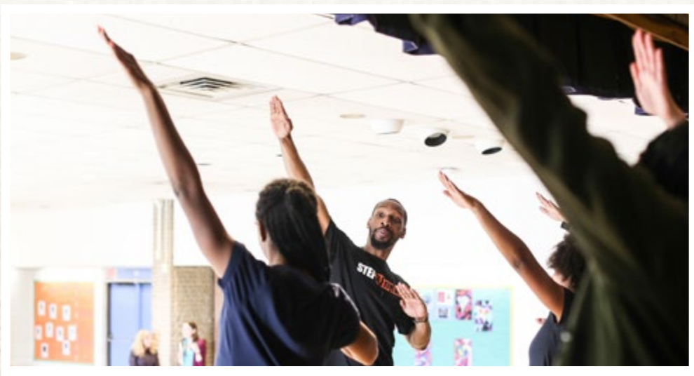
Five Days with STEP AFRIKA! begins November 9

What a start to the new season we have had in Education & Outreach! In this edition of our quarterly newsletter, we share the ways COVID–19 has impacted our programs, update you on the 2020–21 CAPA Marquee Awards presented by American Electric Power Foundation, introduce you to Careers in the Arts–a new virtual series launching in November, and feature this year's virtual Passport to Learning Series.