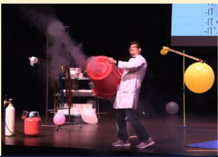
Mister C's Full Steam Ahead

On January 11, we will present Black Violin, the virtuosic duo that crosses classical, jazz, and funk in their performances. Their 40-minute, multicamera video for students in grades 3-12 will present a new, educational performance along with a student-moderated Q&A session. Learn