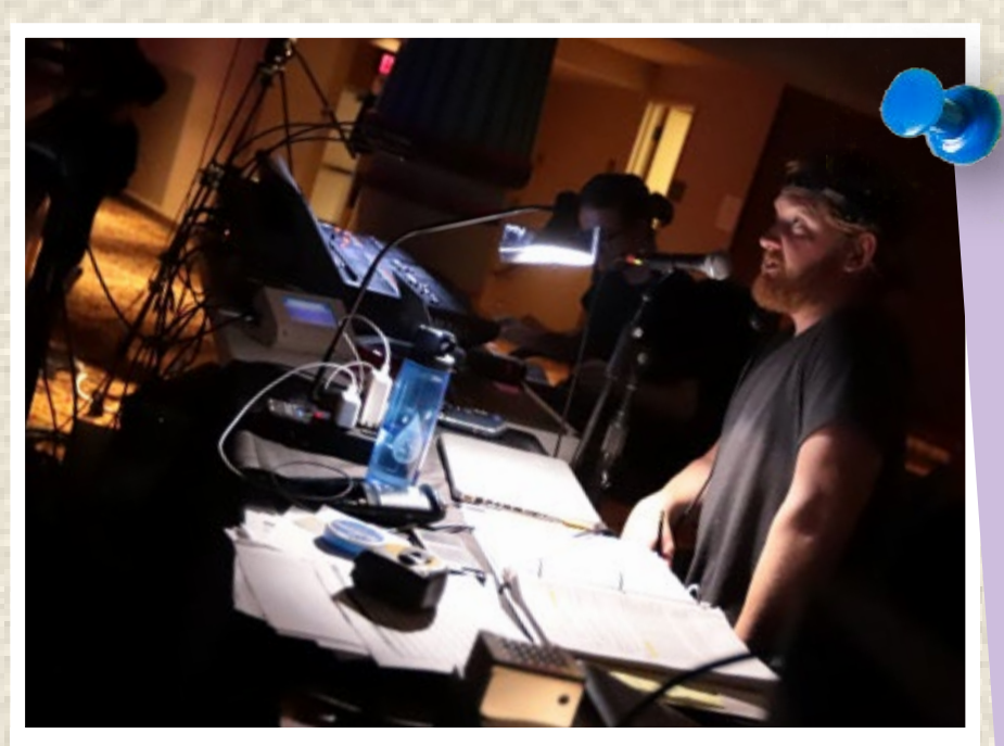
Careers in the Arts launches on November 2