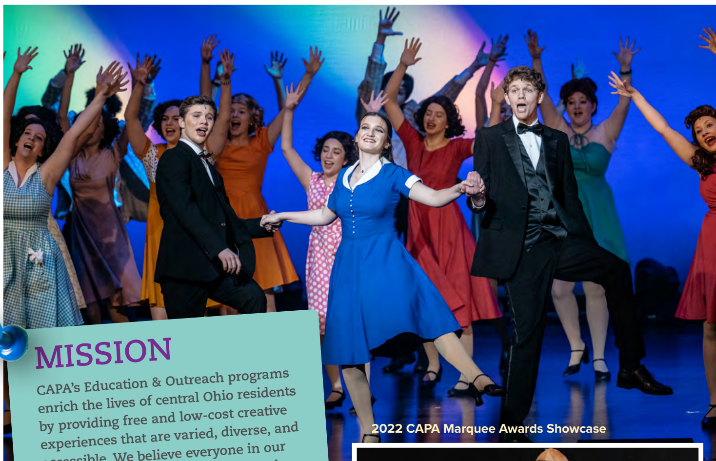
2022 CAPA Marquee Awards Showcase

planned in our Education & Outreach programs, and share two special community projects happening this school year.