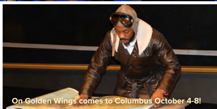
On Golden Wings comes to Columbus October 4-8!