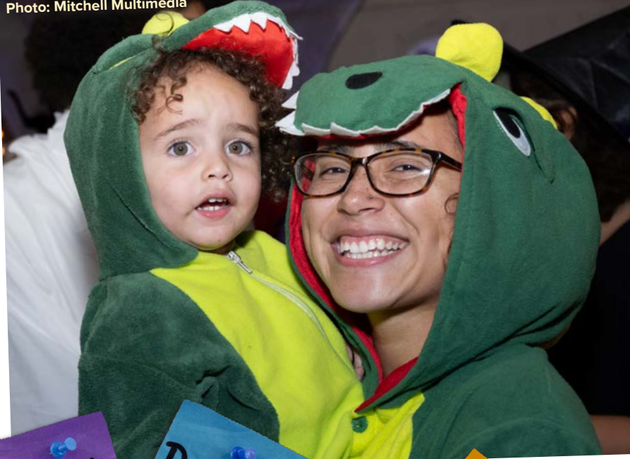
2023 Trick or Treat at the Palace Theatre

“ART HAS THE ROLE IN EDUCATION OF HELPING CHILDREN BECOME LIKE THEMSELVES INSTEAD OF MORE LIKE EVERYONE ELSE.”