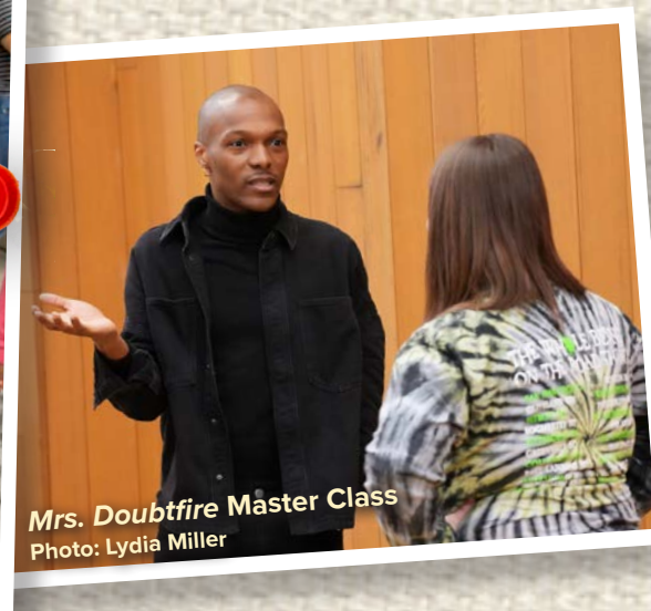
Mrs. Doubtfire Master Class