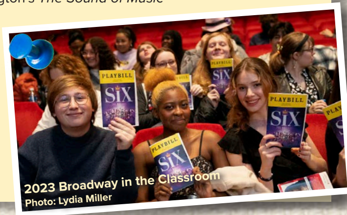
2023 Broadway in the Classroom

February 27 Passport to Learning , Harriet Tubman: Straight Up Outta' the Underground , 10am & 12:30pm, Davidson Theatre