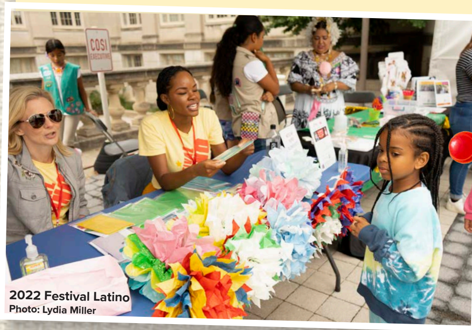
2022 Festival Latino