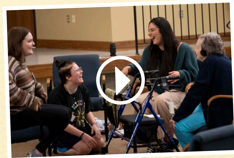
Click on the video to learn more about ARISE.