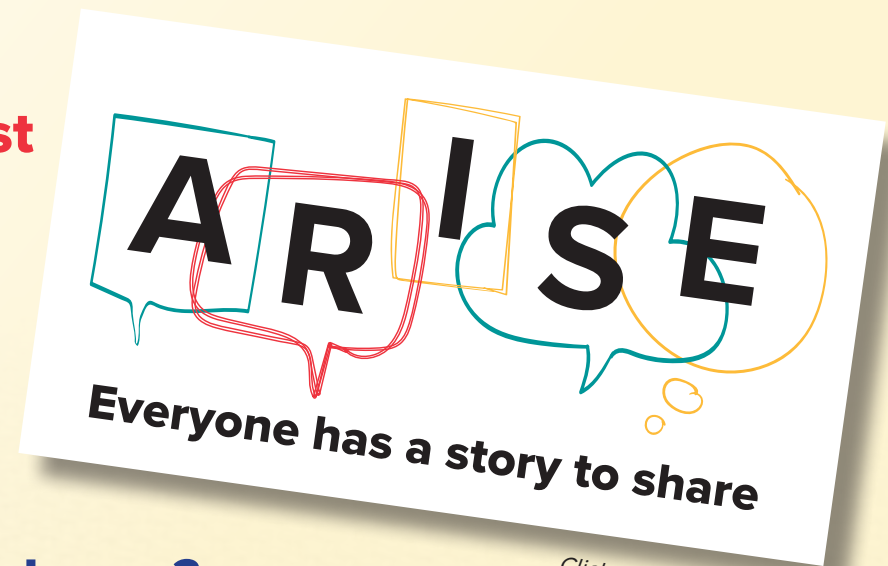
Click on the logo to learn more about ARISE.

Sessions will explore different ways to tell and share stories including activities centered around visual arts, music, dance & movement, and drama.