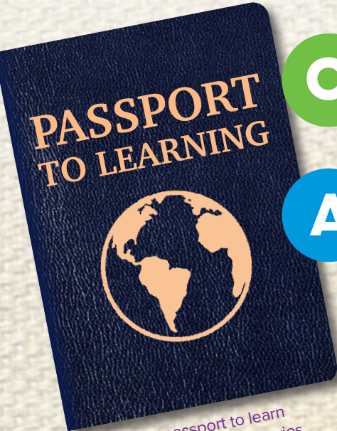
Click on the passport to learn more about our 2023-24 series.