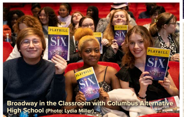
Broadway in the Classroom with Columbus Alternative High School

Join us for the 2023 CAPA Marquee Showcase on May 25!