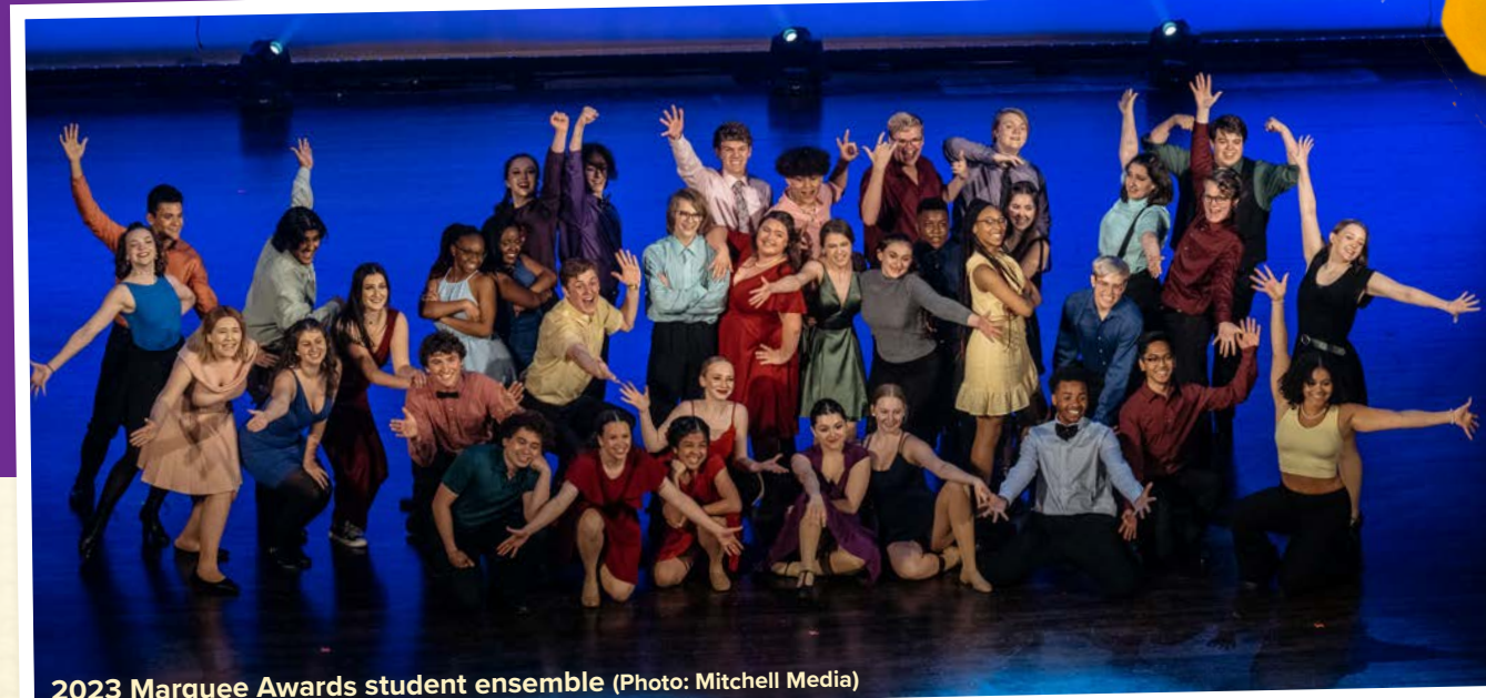
2023 Marquee Awards student ensemble

Best Performer in a Leading Role, as well as opening and closing numbers that incorporate students from all participating high schools. Working alongside our professional crew members backstage each year is our talented team of student technicians.