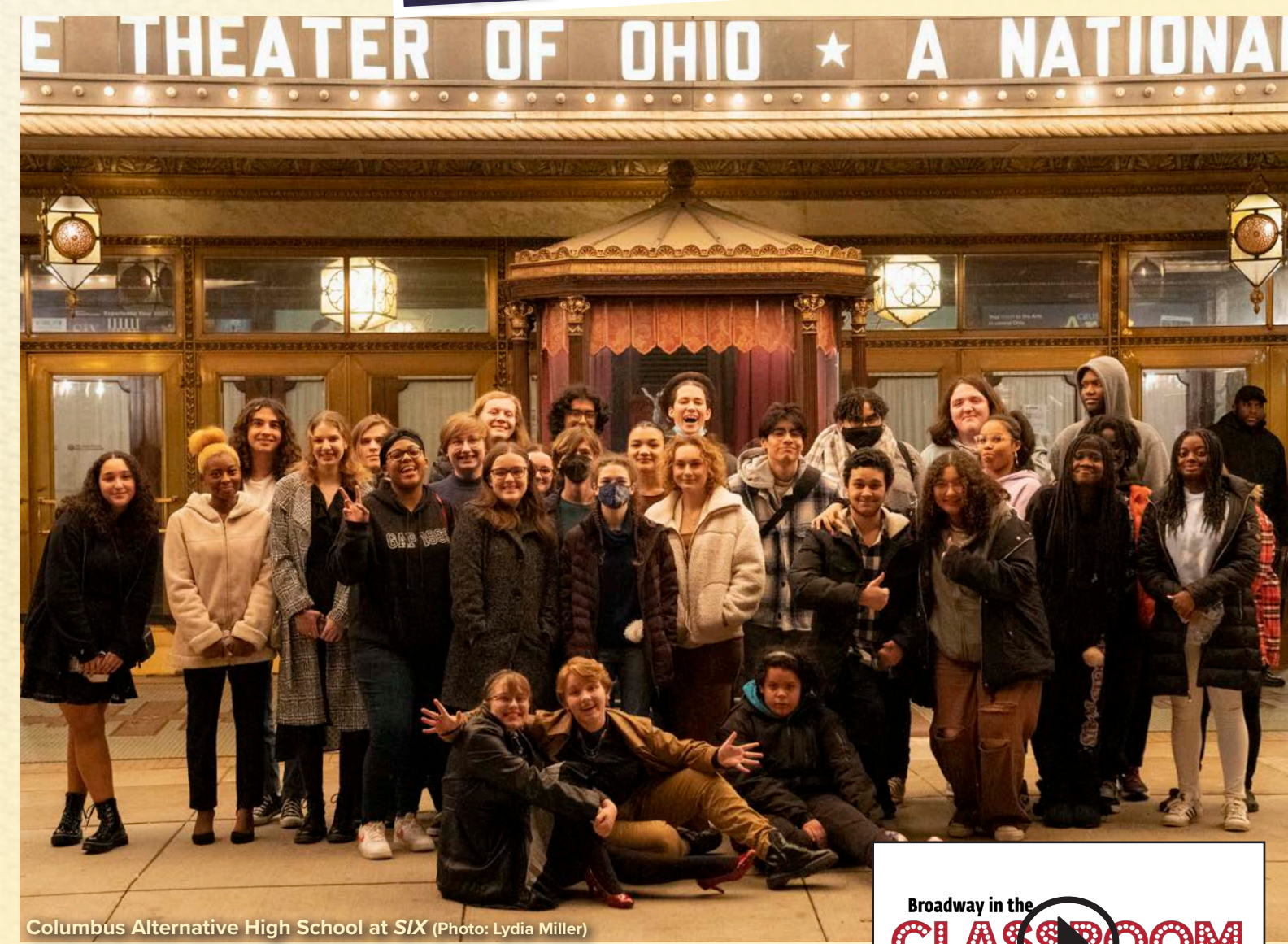
Columbus Alternative High School at SIX