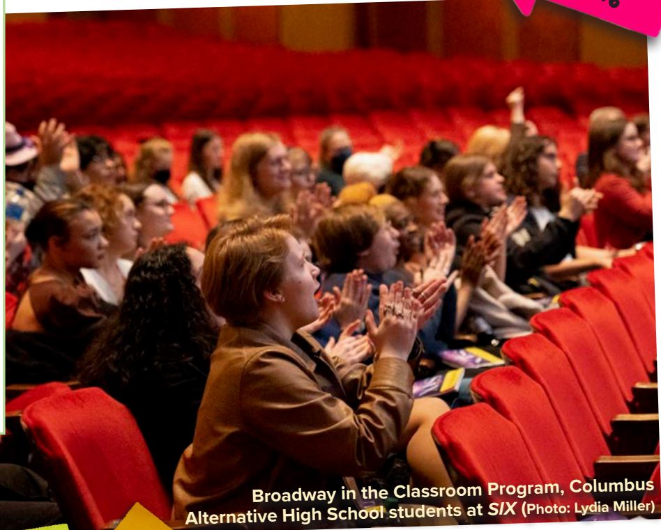
Broadway in the Classroom Program, Columbus Alternative High School students at SIX