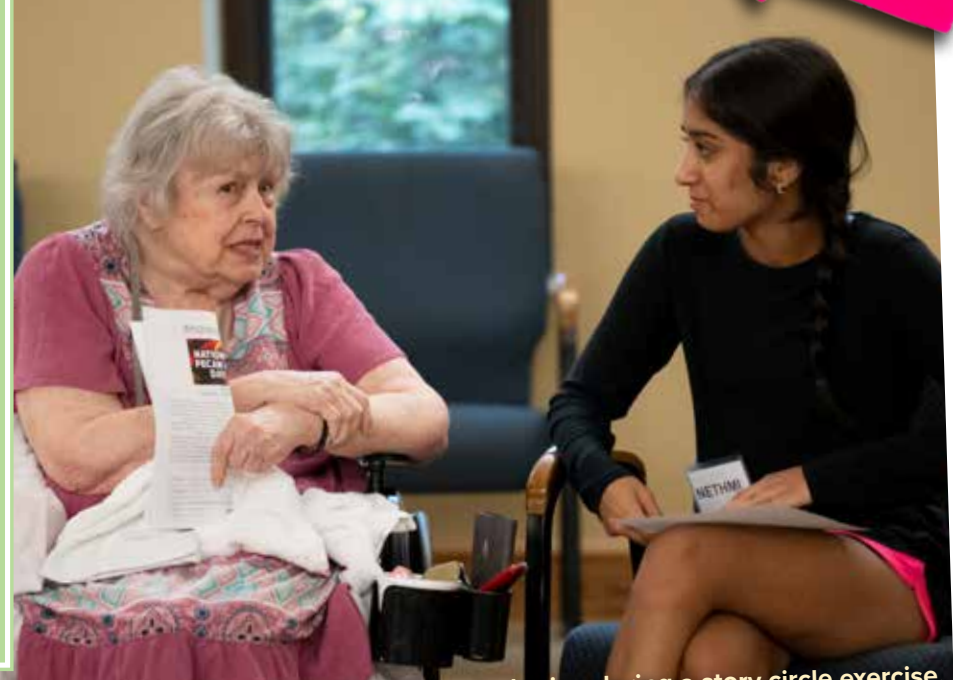
ARISE participants sharing during a story circle exercise.

All of CAPA's Education and Outreach programs are 100% funded by donations. You can be a part of this magic. Donate today! 100%