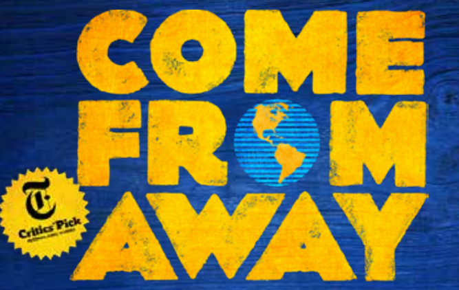
TRUE STORY. HIT MUSICAL.